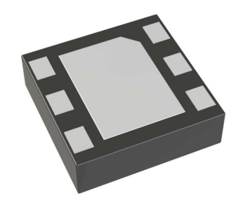
XFN eXtended Flat No-Lead

Simiar with QFN, but superior thermal and electrical performance