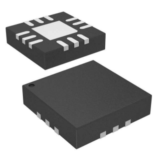
QFN Quad Flat No-Lead

Leadless, surface-mount packages with terminals on the bottom – all 4 sides